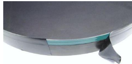
Figure 2: Electrical tape is wrapped around both the glass and the platen.